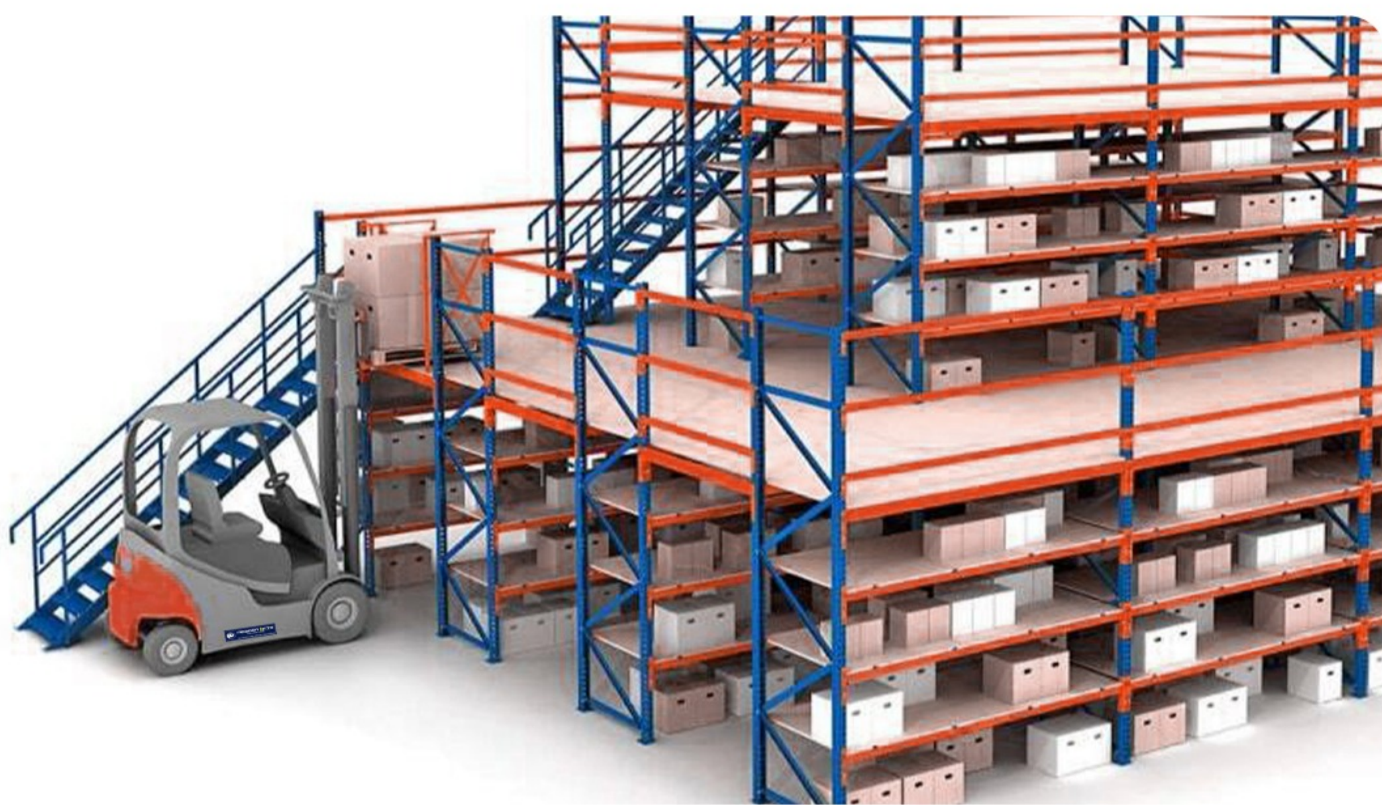
Mezzanine Racking Systems