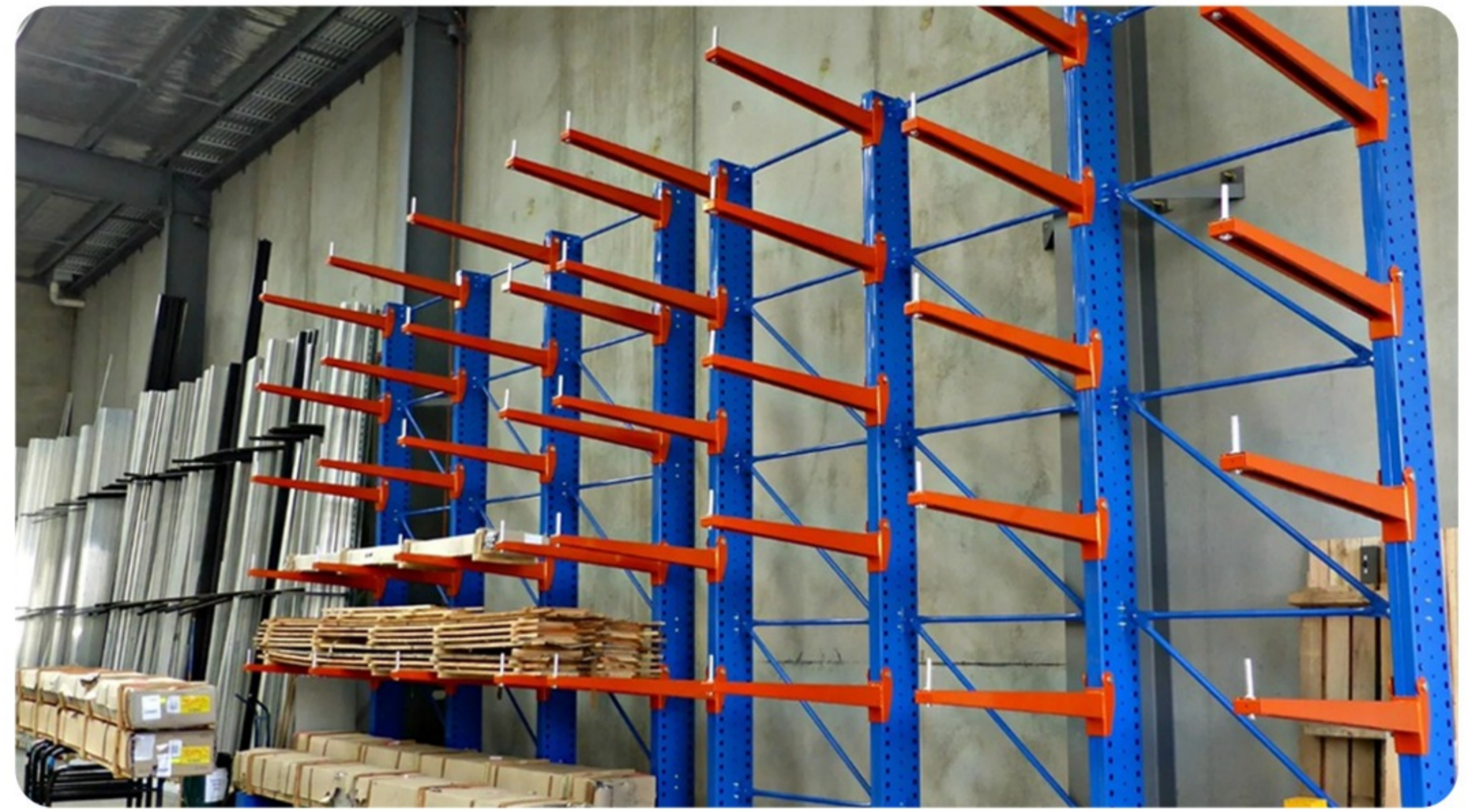
Cantilever Racking Systems

Our racking components are manufactured in high-grade steel to adhere to international standards. Our quality management system ensures that every component passes through multiple quality checks before it gets fixed in your warehouse. Newgen's project management team members are agile and highly experienced in project planning, quality control and timely execution. Our proactive approach helps us to anticipate restraints and take necessary steps to successfully deliver projects on time and bring 100% customer satisfaction.